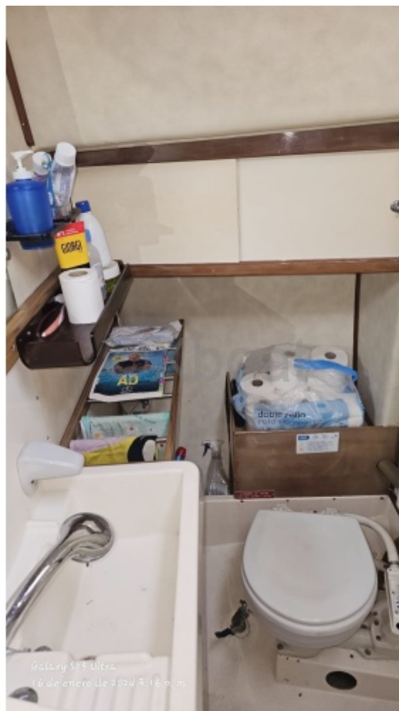
Galaxy S83 Ultra 6 de enero de 2024 9:16 a.m.