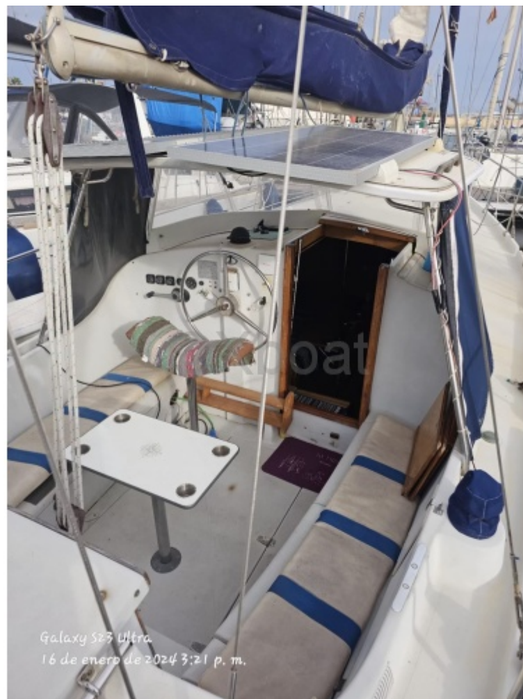
Galaxy S23 Ultra 16 de enero de 2024 3:21 p. m.