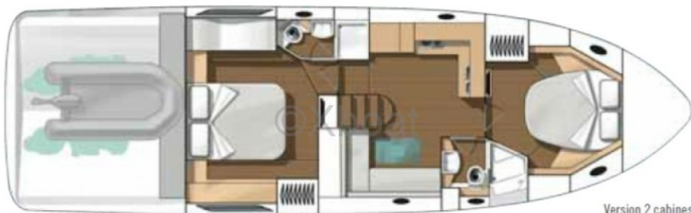
Version 2 cabines.